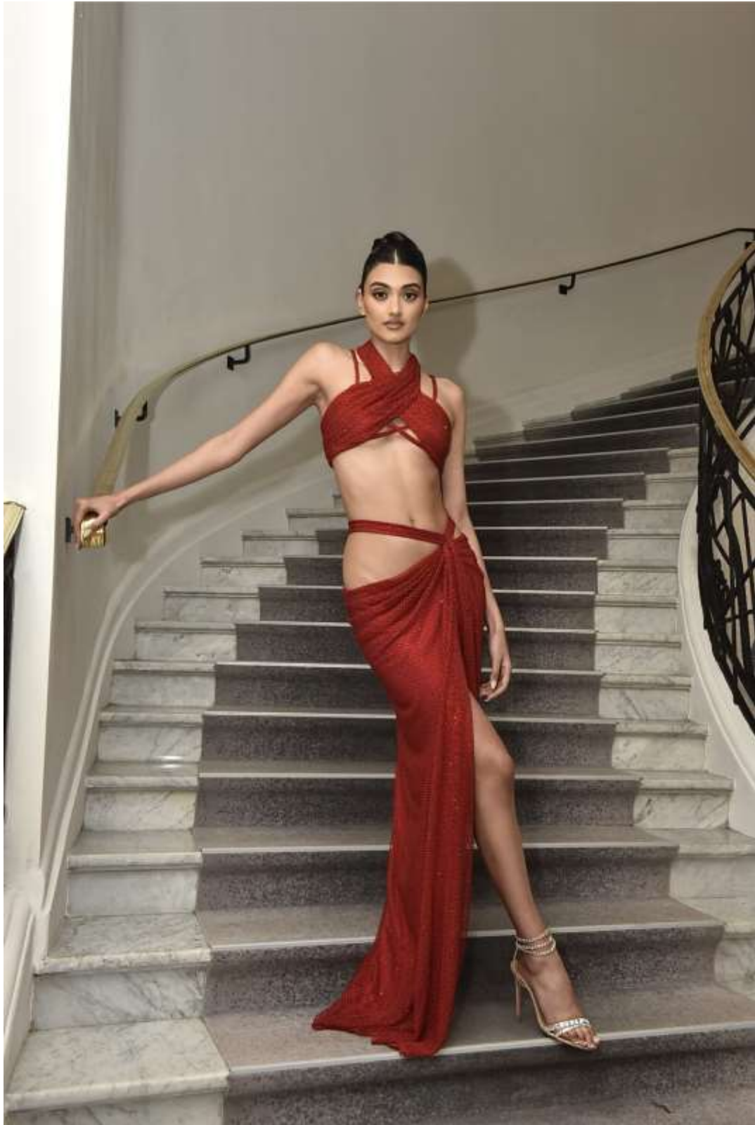
Neelam Kaur Gill in a custom couture crystallized fishnet set with a draped cut-out skirt and top.