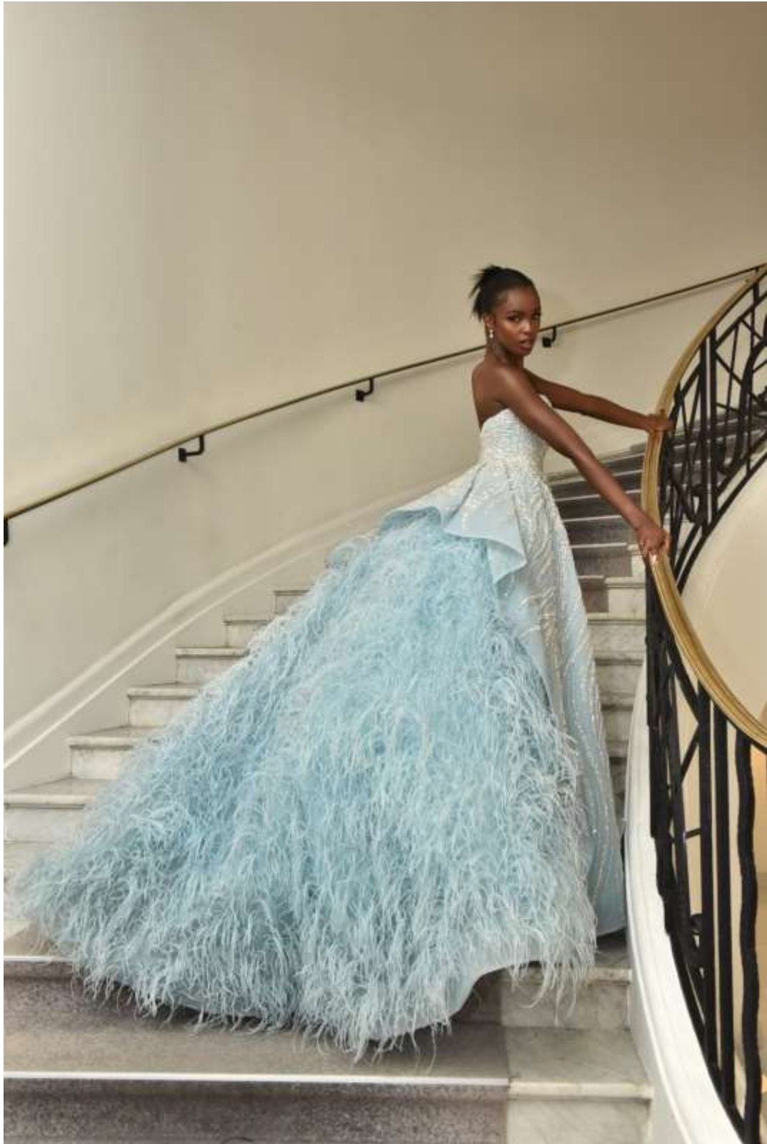
Leomie Anderson in a couture princess-cut gown embellished with sequins & Swarovski, featuring a back-twist of upward feathers.