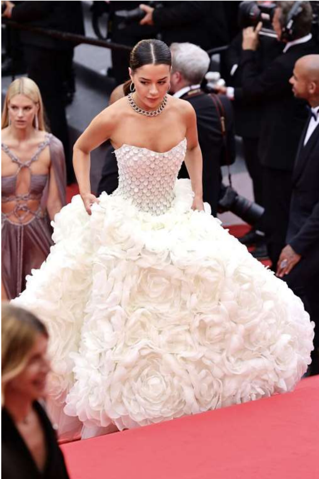
Tessa Brooks in a couture Spring-Summer 2022 “Lucid Algorithms” collection gown featuring a voluminous ruffled organza skirt and delicate embroidery.