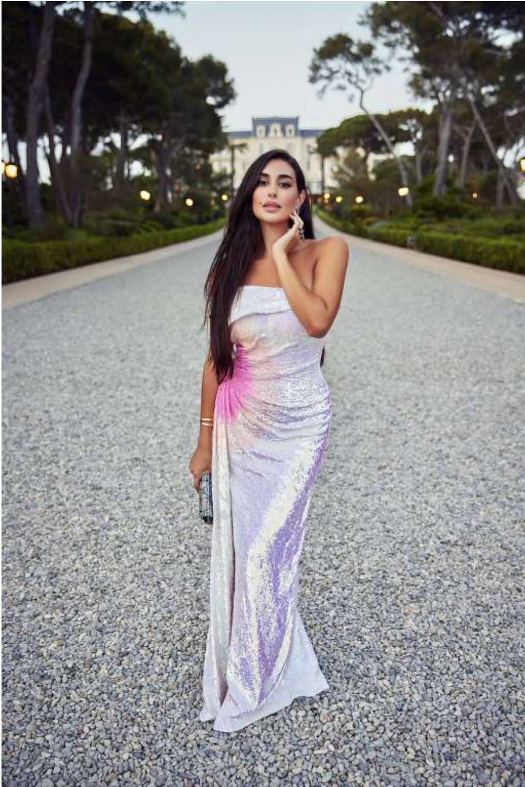
Yasmine Sabri in a holographic custom-made couture one-shoulder gown of handmade dégradé sequins.