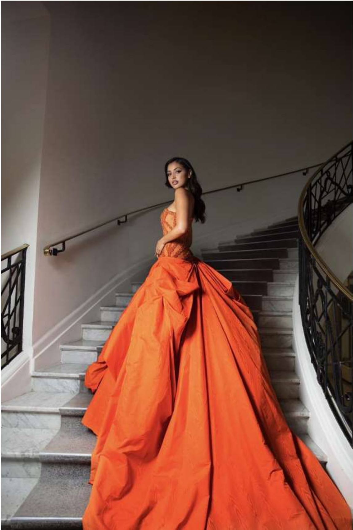
Cindy Kimberly in an orange custom couture gown with a hand-embroidered bodice and dramatic taffeta overskirt.